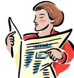
Parish Council News